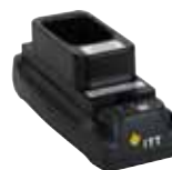
Single-bay battery charger