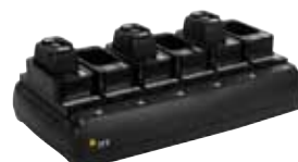
Multi-bay battery charger